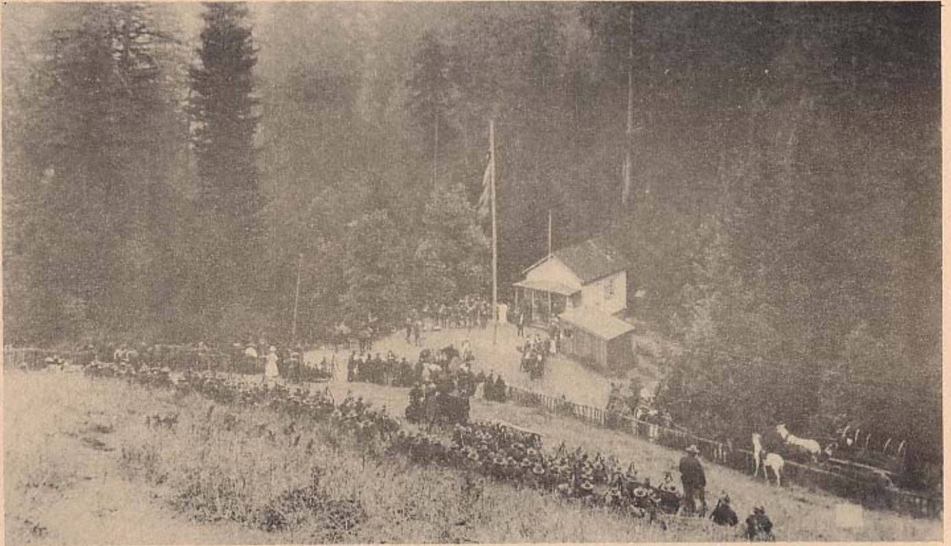
A proud day for Glenwood School in 1902 when returned veterans of the Spanish-American War visited and presented the school with an American flag. This schoolhouse, located near the foot of the Mountain Charley Road, burned to the ground a few years later, and the school moved to the settlement of Glenwood, further north.