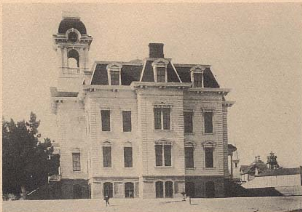
Mission Hill School, Santa Cruz District 1, built in 1879 to replace the original 1857 one-room Mission Hill School--the first public school structure in Santa Cruz County. The building shown above had a basement used for classes, two floors above that, and a top story in which the county's first high school was conducted.