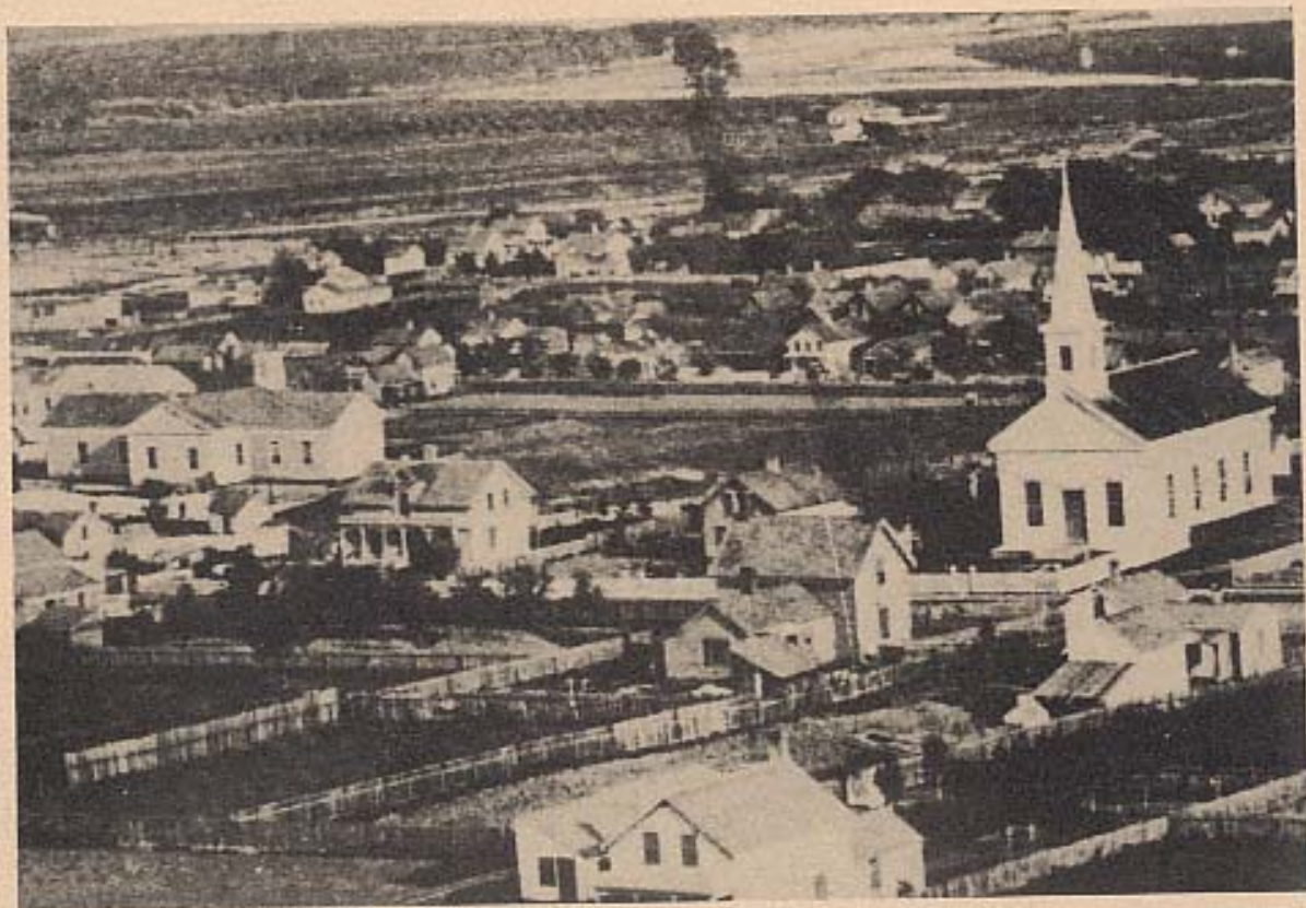
A very early view of Mission Hill which is unique because it shows both the First Methodist Church where school was held before the first schoolhouse was built--and the first schoolhouse. It is at the left, the building with wings sprouting on either side, plus a small bell tower. Note orchards in the background--downtown today.